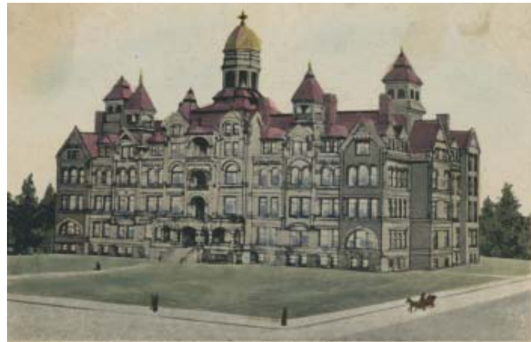
Postcard courtesy of Roberta Morey