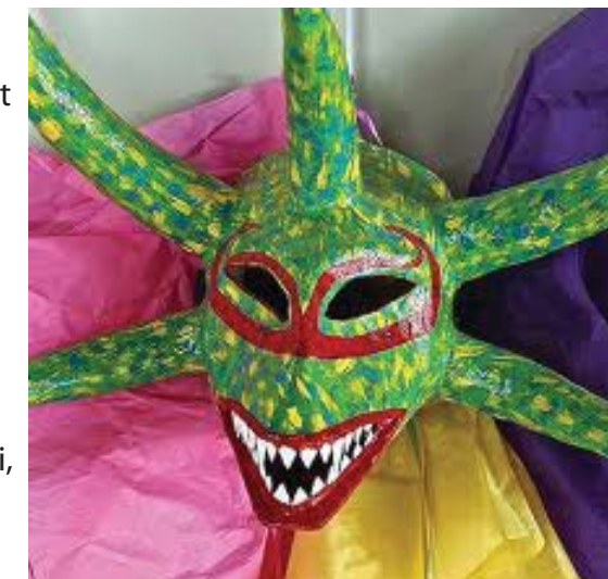
An example of the type of masks worn during Puerto Rico's Ponce Carnival.