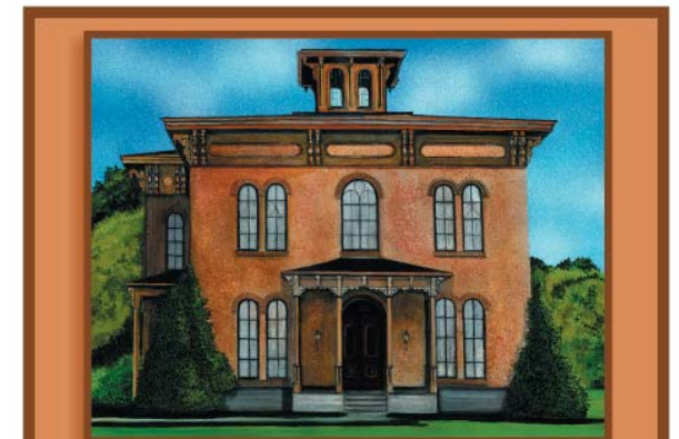
The Parker House