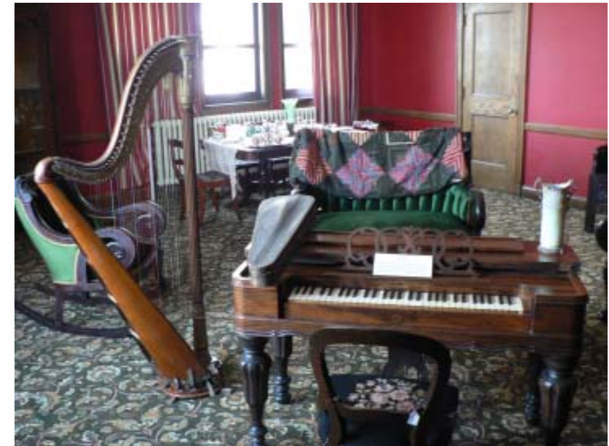
A sneak peek at our Victorian Parlor on the second floor.

We are offering several Girl Scout badge workshops throughout the summer beginning June 10th . We are excited about our Girl Scout sleepover set for Friday, June 12th . Troops will see the movie “Night at the Museum 2” and then return to the Castle to enjoy slumber party games and food. There is no doubt our museum will come alive that night!